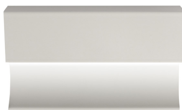
pro-skirting led white