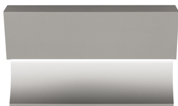
pro-skirting led anodized