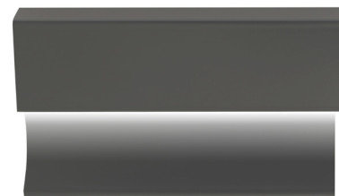
pro-skirting led black