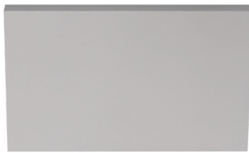
pro-skirting anodiced aluminium