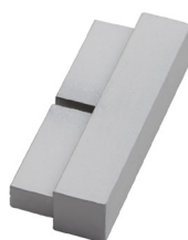
pro-skirting corner anodiced aluminium