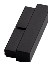
pro-skirting corner anodiced aluminium