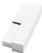
pro-skirting corner white